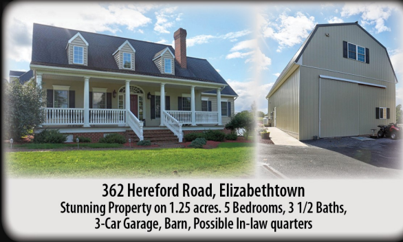
362 Hereford Road, Elizabethtown Stunning Property on 1.25 acres. 5 Bedrooms, 3 1/2 Baths, 3-Car Garage, Barn, Possible In-law quarters