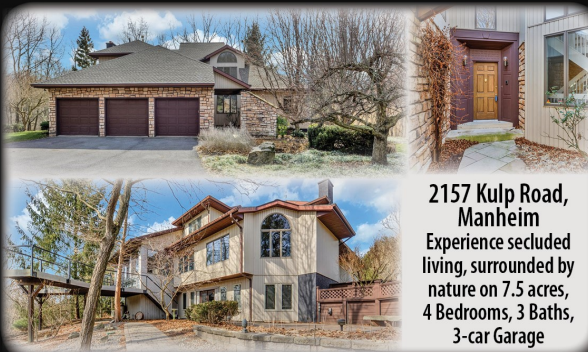
2157 Kulp Road, Manheim Experience secluded living, surrounded by nature on 7.5 acres, 4 Bedrooms, 3 Baths, 3-car Garage

Excellent Communicators Return Phone Calls/Correspondence Promptly